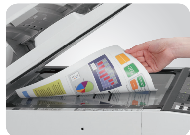
Full colour scanning