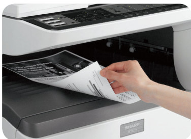
Duplex printing & copying